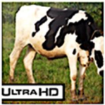
Cow Mooing Sound Effect and video (4k).mp3

The other sounds of sheep and cows were fairly straightforward and the drip, drip drip of melting icicles you see in the film was from a film of raindrops on YouTube. The tractor was from YouTube's free audio library.