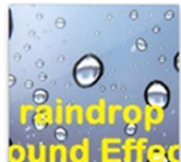
raindrop Sound Effect.mp3