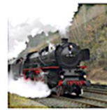
The Sound of Steam Trains (HD).mp3

The whole exercise was quite enjoyable and for anyone wanting to add soundtracks to cine films, YouTube and its free audio library is a must!