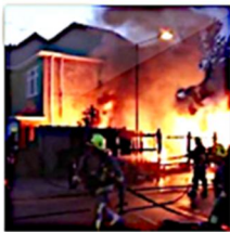
Burning House Fire - Kent Fire and Resc...ut Flames.mp3

The soundtrack on the film I chose (Burning House Fire – Kent) had the sound of people in the background, fire engines, firemen using hose pipes and fire crackling in the background. Perfect. Using AIRY (The YouTube Downloader app) I downloaded the film – as an mp3 file – sound only. ( AIRY lets you decide – MP4 for full film or MP3 – sound only). ( Airy is free but you have to pay a one off fee to download 1080p films )